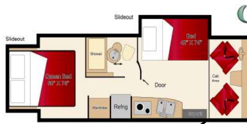
NAVION IQ #3 MOTORHOME - NIGHT